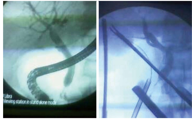
Figure 1 Short stricture at lower third common bile duct stone with small stone above the stricture.

Statistical analysis of the data in this study was performed