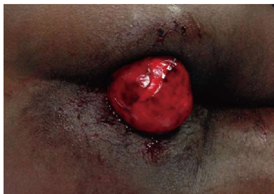
Figure 1 Protruding mass from anal canal in the emergency room (left lateral decubitus position).

A sixty-one years old male patient with a diagnosis of schizophrenia and chronic constipation presented to the emergency room with a prolapsed ano-rectal mass. The patient noticed the propulsion of the mass while defecating four hours prior to his presentation to our hospital. Associated anal pain and minimal bright red blood per rectum were reported; however, all remaining review of systems was negative. The patient had no previous history of gastrointestinal symptoms or pathologies-denies change of bowel habits and any history of hemorrhoids or prolapse. He had never undergone a colonoscopy. On physical examination, the firm, well circumscribed, tender, hyperemic mass