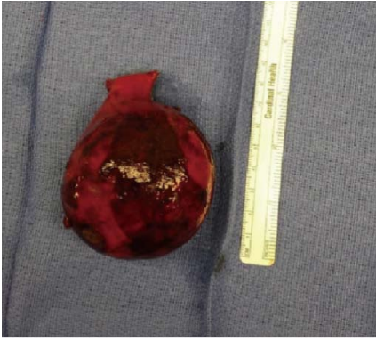
Figure 2 Gross view of the resected specimen.