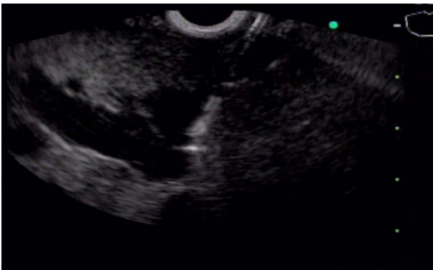
Figure 2 Biliary puncture.