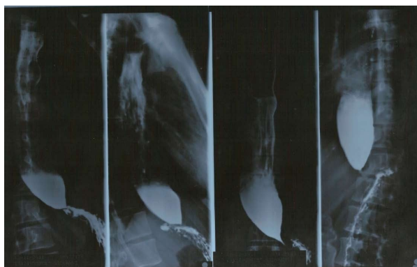
Figure 1 Barium swallow esophagograms showing typical bird-beak appearance of the distal esophagus.

injected during upper endoscopy through an injection needle directly in four or eight quadrants into the LOS at the dose of 80-100 units [51,52] .