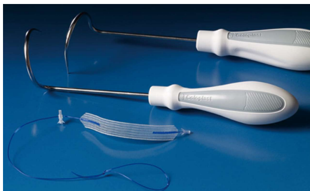
Figure 4 Altis sling.

groups. However the number of patients complaining of tight pain resulted to be significantly higher in the TOT group compared to the Ophira® group (7.1% vs 0% respectively; P = 0.04 ). Two patients in the Ophira® group had the tape cut for voiding obstruction [20] .