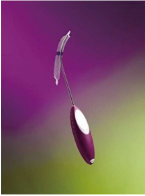
Figure 5 Miniarc sling.