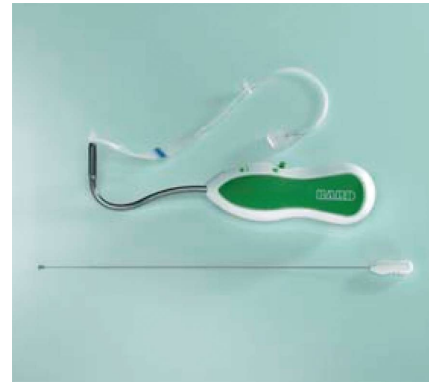
Figure 2 Ajust sling.

The third RCT is a comparison between three