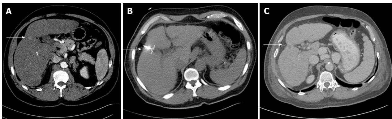
Figure 1 Sixty-eight-year-old male with hepatitis C and cirrhosis. A: Contrast enhanced CT shows a 16 mm HCC; B: RFA probe covering the lesion; C: Post contrast follow up CT shows capsular retraction at the site of the RFA and no residual tumor. HCC: Hepatocellular carcinoma; RFA: Radiofrequency ablation; CT: Computed tomography.

This review focuses on the use of percutaneous ablative techniques in the treatment of HCC, as well as of metastatic disease from colorectal, neuroendocrine, and breast carcinomas.