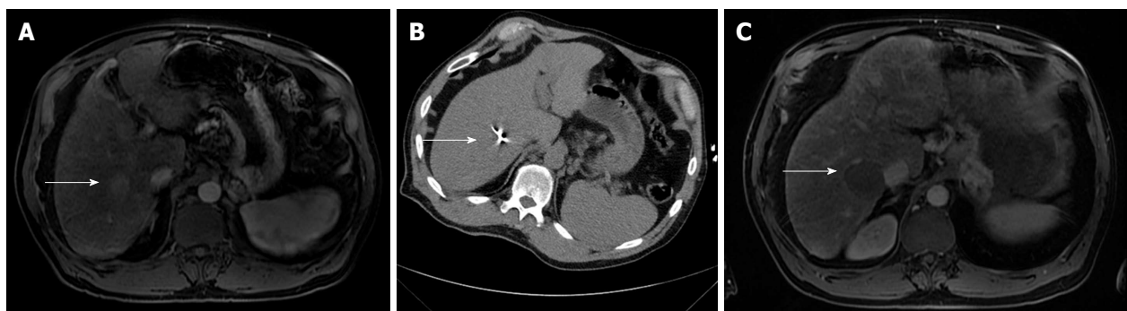
Figure 3 Sixty-two-year-old with hepatitis C cirrhosis. A: MRI shows an arterial enhancing lesion consistent with hepatocellular carcinoma; B: CT guided microwave ablation of the right hepatic lobe lesion; C: MRI shows an ablation zone and no evidence of residual tumor. MRI: Magnetic resonance imaging; CT: Computed tomography.

(Figure 3). This results in markedly increased kinetic energy and subsequent tissue heating [21] . Tissues with a larger concentration of water, such as tumors, are particularly susceptible to microwave heating [21] .