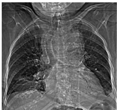
Figure 1 Chest radiography showed a widened mediastinum and tracheal deviation.