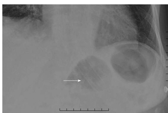
Figure 4 Chest X-ray demonstrating migration of the esophageal stent to the level of the gastroesophageal junction (arrow).

Any patient with a previous history of thoracic aortic