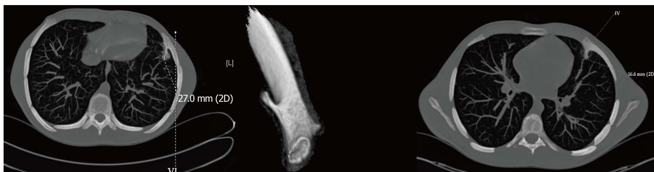
Figure 1 Thoracoscopic findings. Exostosis originating from the costochondral junction of the ribs, with the tip adjacent to the pericardium. The thickening of the pericardium and pleura was caused by scratching with the exostosis during respiratory movements and cardiac pulsations.