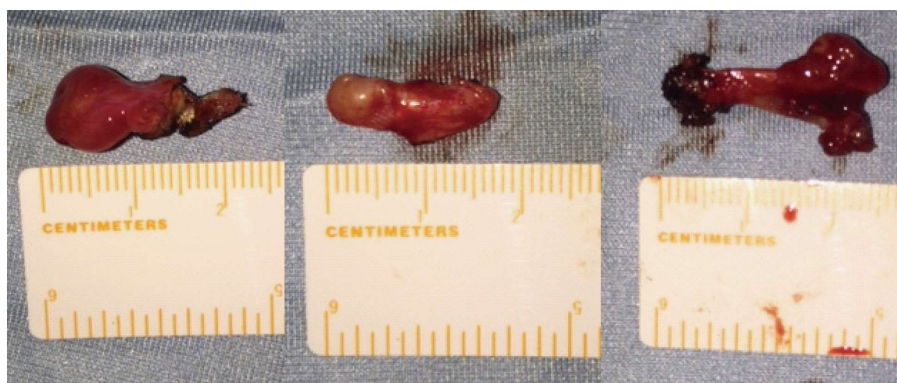
Figure 3 Macroscopic aspect of exostosis.

carpals, phalanges are involved [1] . Costal exostoses may be difficult to recognize on the chest using only X-ray and the chest CT scan is usually suitable [3-5] . Malignant transformation is seen in 0.5%-5% cases of MHE. Axial sites as ribs, spine, pelvic hips and shoulder are sites of increased risk of malignant transformation. Average age at malignant transformation in MHE is 25-30. It is rare before 20 years of age.