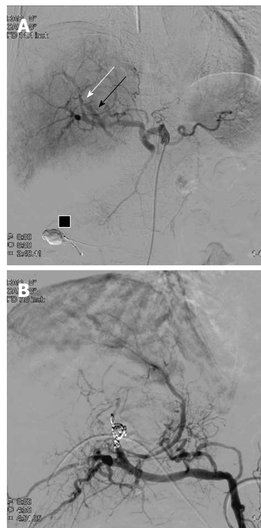
Figure 4 The 2 nd digital subtraction angiography image. A: Selective digital subtraction angiography image of the common hepatic artery showing an arterio-biliary fistula (white arrow) between A8 and the common bile duct (black arrow). Embolic material that migrated into the afferent loop is present (black box); B: Proximal A8 embolization obliterated the pseudoaneurysm. Leakage of contrast medium was completely controlled after embolization.

jaundice. We presume that this hepatic pseudoaneurysm might have formed as a result of traumatic stimulation related to the plastic stent placement because it had been placed improperly, with its tip located at the site of the aneurysm. Yet, this may not be the only cause. The patient's history of cholangitis and CBD stones could have also contributed to the formation of the pseudoaneurysm. In daily clinical