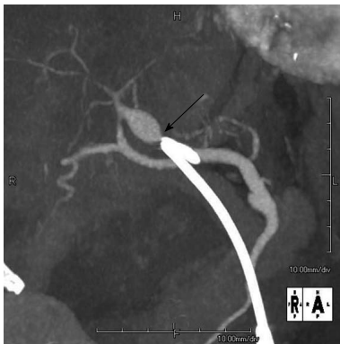
Figure 2 Abdominal computed tomography angiography. A 13 mm × 10 mm pseudoaneurysm was found at the proximal anterior segment of the right hepatic artery; The hepatic side edge of the plastic stent (black arrow) was close to the pseudoaneurysm.

A8, proximal to the pseudoaneurysm (Figure 4B). Subsequently, the patient developed an S8 (Couinaud classification) liver abscess, which was treated successfully by percutaneous transhepatic drainage.