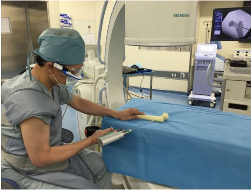
Figure 2 The operator inserting a 3.0 mm Kirschner wire in a plastic femoral bone under a fluoroscope while viewing the fluoroscopic video on PicoLinker.