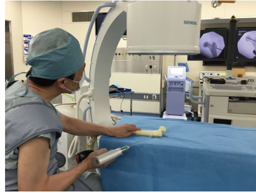
Figure 3 The operator inserting a 3.0 mm Kirschner wire in a plastic femoral bone under a fluoroscope without PicoLinker, while viewing a conventional fluoroscope monitor.

monitor (Conventional group) (Figure 3). The time from picking up the wire to completion of insertion, total radiation time and the TAD on anteroposterior view were measured and evaluated.