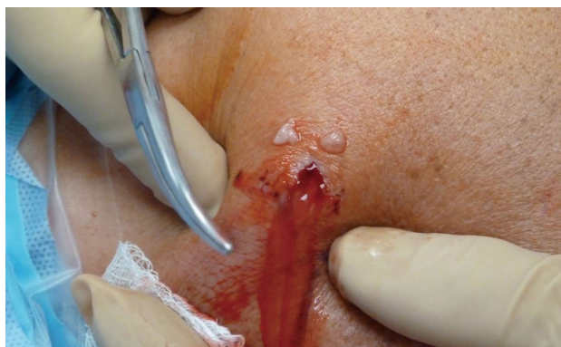
Figure 1 Drainage from an infected arthroscopy portal immediately before the arthroscopic debridement and lavage. After anesthesia the patient is positioned and the shoulder is draped. An incision is made through the infected portal and cultures are taken from the draining pus. Additional deep tissue cultures are sent during the arthroscopic debridement (Courtesy of University of Manitoba, Section of Orthopaedic Surgery, Pan Am Clinic, Winnipeg, Manitoba, Canada).