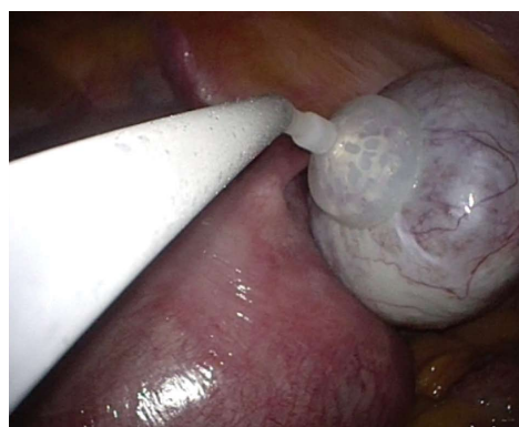
Figure 1 By using "Ova-Lead", aspirate sucking and fix the ovaries to the cup.

The patient was a 38-year-old woman, gravida 0 para 0. Bilateral adnexal masses were identified during the early stage of pregnancy. Pelvic MRI revealed a 70-mm left adnexal mass and a 50-mm right adnexal mass. Both were thought to be mature cystic teratomas, so laparoscopic surgery was scheduled and performed during gestational week 14. We placed a RapidPort EZ Access Port in the umbilicus. We encountered extensive adhesions within the peritoneal cavity. Traction was applied to the left adnexa by means of an organ fixation device, "Ova-Lead" until the mass reached the umbilicus, and the mass was resected extracorporeally. Applying traction to the right adnexa proved difficult due to the adhesions, so we simply performed paracentesis. The fluid contained hemorrhagic components, so we suspected an endometrioma. The left adnexal mass was diagnosed histologically as a mixed cystic teratoma and endometrioma. No recurrence of the right mass was noted during the remaining course of the pregnancy.