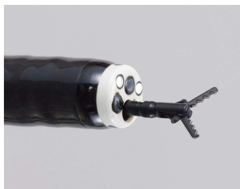
Figure 1 The distal tip of the Clutch Cutter (long type: Blade length of 5 mm).

Otsuka Y, Akahoshi K, Yasunaga K, Kubokawa M, Gibo J, Osada S, Tokumaru K, Miyamoto K, Sato T, Shiratsuchi Y, Oya M, Koga H, Ihara E, Nakamura K. Clinical outcomes of Clutch Cutter