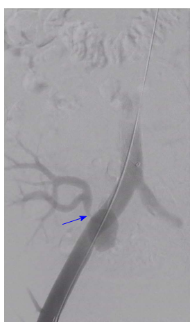
Figure 2 Angiogram showing transplant renal artery stenosis (blue arrow) due to compression caused by the pseudoaneurysm. Guide wire is present within the right common and external iliac artery.