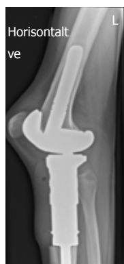
Figure 1 Radiograph of a reconstruction with a proximal tibia tumor prosthesis.

The aim of the present study was to identify differences in surgical treatment strategies for patients with bone sarcomas in the lower extremities between