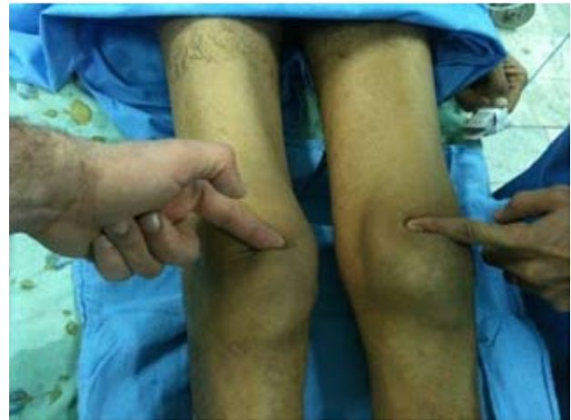
Figure 1 Palpation showing bilateral depression above the patella.

A 43-year-old male with renal failure (hemodialysis for 20 years) presented with bilateral pain and cutaneous