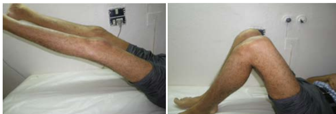
Figure 5 Complete active extensions of the knees.