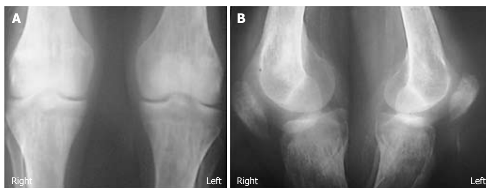
Figure 2 Knee radiographs showing patellar lowering and diffuse bone demineralization. A: Antero-posterior X-rays; B: Lateral X-rays.