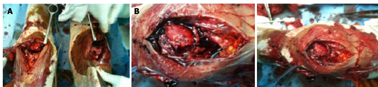
Figure 4 Surgical management of the injury through bilateral reinsertion of the tendon. A: Exposing the bilateral rupture of the quadriceps tendon; B: Quadriceps tendon reinserted through tendon-to-bone repair.