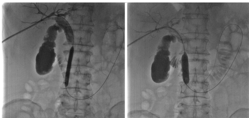
Figure 2 Sequential dilation of the sphincter of Oddi with an 8 mm × 60 mm and a 14 mm × 40 mm balloon.