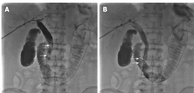
Figure 3 Empty balloon was then withdrawn above the stones, inflated, and used to push the stones into the duodenum through the sphincter of Oddi. A: The empty balloon was withdrawn above the common bile duct stones (white arrow) and then re-inflated. B: The common bile duct stones (white arrow) were pushed into the duodenum through the dilated sphincter of Oddi.

drainage catheter was placed in the gallbladder and removed after two weeks without residual stones.