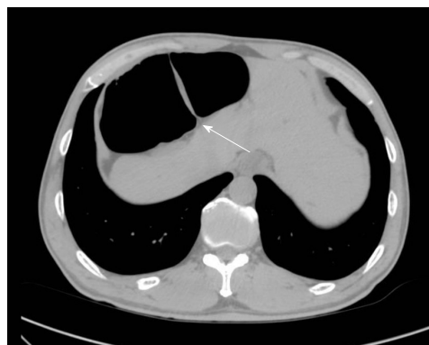
Figure 1 Computed tomography findings. Computed tomography shows an interposition of the colon hepatic flexure between the liver and the right diaphragm.

A 59-year-old male patient was admitted to the De-