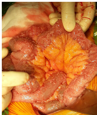
Figure 3 Diffuse miliumary carcinomatosis on the small bowel as an example of contraindication for complete cytoreductive surgery.