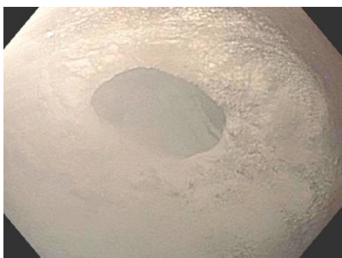
Figure 5 No residual bleeding following Hemospray® with whitish material coverage the ulcer bed.