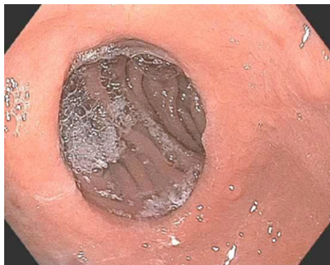
Figure 1 Dilated gastric-jejunal anastomosis prior to endoscopic treatment for weight regain.

The depth of penetration is associated with power input in watts and the greater the wattage applied the deeper the penetration, which may result in injury to the muscular layer. After APC ablation is performed around the anastomotic ring, tissue contracts and results in scar formation, which reduces the caliber of the GJA. As a result, the goal of delayed emptying and early satiety can be achieved, and this contributes to weight loss. In general, APC is safe with few complications reported in the literature, such as anastomotic stricture, ulcer formation, bleeding, and leakage at the GJA [2,11,15] .