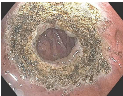
Figure 2 Gastric-jejunal anastomosis following argon plasma coagulation treatment for weight regain.