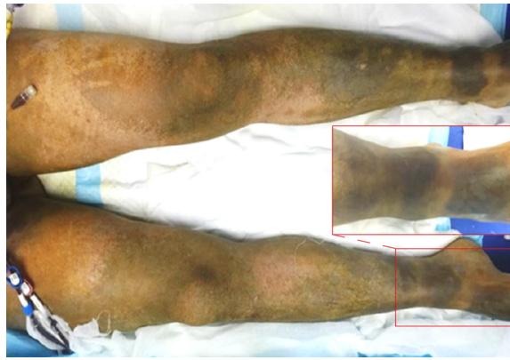
Figure 1 The third-degree burns had a brown, tough, leather-like appearance, whereas the deep second-degree burns had a beige and soft appearance.