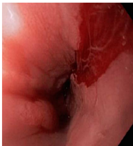
Figure 4 Superficial tear of the proximal esophageal mucosa.