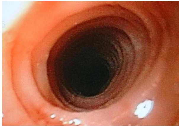
Figure 5 Trachealized mucosa of the esophagus.

complete remission increased to 85% at 12 wk. Histological remission was achieved in 93% of patients treated with budesonide vs 0% in patients treated with placebo [75] .