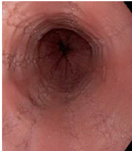
Figure 2 Longitudinal furrows in the esophagus.

are insufficient for the diagnosis of EoE [44] . In addition, the endoscopic appearance of the esophagus may be normal in 10% to 25% of patients with EoE [45-47] .