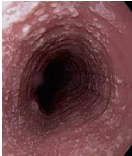
Figure 3 Whitish exudate in the esophagus and trachealized esophagus.

with EoE with an AUC of 0.84 and non-GERD patients with an AUC of 0.83 [52] .