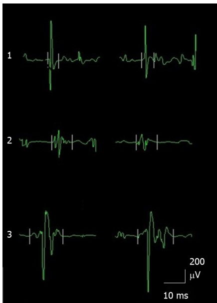
Figure 2 The electromyography waveforms in the subjects. The time between the two vertical white bars is the duration of the electromyography waveform. 1: The normal control group; 2: The functional epiphora group; 3: The facial palsy group. The bar represents 10 ms.

potentials was less than 2 mV, and the durations were 10–5 ms with 3–4 phases. Intramuscular sprouting and re-innervation can occur in chronic partial denervation, and the amplitudes might be 10–20 mV and durations might increase to 20–30 ms. In primary muscle disease, only slight motor unit amplitude potentials of short duration were observed; typical amplitude and duration values would be 0.5 mV and 5–10 ms, respectively [11] .