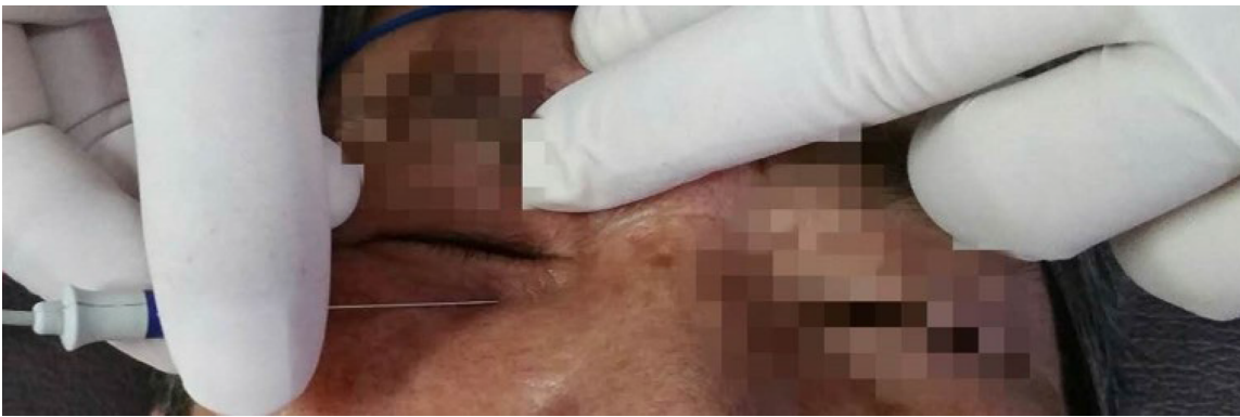
Figure 1 Electromyography of the orbicularis oculi muscle: A disposable concentric facial electromyography needle electrode was inserted into Horner's muscle.