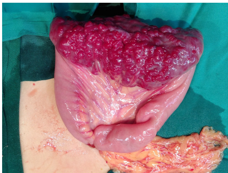
Figure 3 Intraoperative image showing that there was a 10 cm × 4 cm lesion on the ileum with bluish purple coloration and compressible varices on its surface.

partial or total calcifications of the thrombus and are an important diagnostic criterion that can be observed in 26%-50% of adult patients, especially in young patients, and phleboliths are virtually pathognomonic of hemangiomas if they are grouped [33-35] . Phleboliths and malformed vessels were evident in our case.