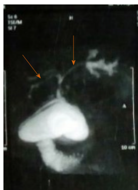
Figure 2 Magnetic resonance cholangiopancreatography of a patient with inflammatory bowel disease and primary sclerosing cholangitis showing dilatation of the intra- and extra-hepatic biliary tree with multiple strictures (arrows).