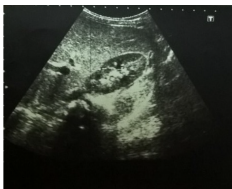
Figure 1 Abdominal ultrasound of a patient with inflammatory bowel disease showing increased liver echogenicity.

ALT: Alanine aminotransferase; AST: aspartate aminotransferase; ALP: Alkaline phosphatase; DB: Direct bilirubin; IQR: interquartile range; GGT: Gamma-Glutamyl transferase; INR: International normalized ratio; PC: Prothrombin concentration; PT: Prothrombin time; TB: Total bilirubin.