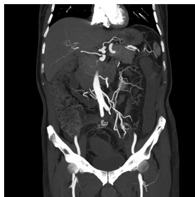
Figure 3 Postoperative magnetic resonance angiography showing opacification of the arterial and venous inferior mesenteric system.

hospital for a right groin hernia. Although he had been discharged in good condition, he was readmitted after ten days with symptoms of intestinal obstruction. An abdominal CT scan revealed a dilated colon and extensive transmural edema of the colonic wall extending from the splenic flexure to the end of the rectum along with pericolic fat edema. Dilation of the vascular branches of the IMA-V plexus within the bowel wall of the anal canal, rectum and inferior sigmoid was noted, raising suspicion of an arteriovenous communication (fistula) between the branches of the inferior mesenteric artery (IMA) and vein (IMV) (Figure 1). An elective angiography of the IMA confirmed this suspicion and further defined at least four definite points of high flow between all IMA and IMV branches and with the hemorrhoidal plexus (Figure 2). The patient's worsening condition prompted laparoscopic (robotically assisted) exploration. The pro-