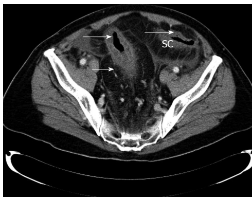
Figure 1 Preoperative computed tomography scan showing edematous sigmoid colon with irregular luminal narrowing within the colonic wall (arrow) and hypoperfusion of the sigmoid colon in the venous phase. SC: Sigmoid colon.