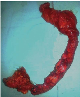
Figure 5 Photo of atrophic and ischemic descending and sigmoid colon.

underwent an additional procedure to reconnect the colostomy. A left hemicolectomy was performed, as the remaining descending colon, sigmoid and upper rectum were not functional due to atrophy and ischemia (Figure 5). The right colon was directly anastomosed to the upper rectum and a prophylactic ileostomy was performed. The patient's postoperative course was complicated on the tenth day by a pulmonary embolism that was treated with low molecular weight heparin for a week followed with oral anticoagulants. The patient was discharged in very good health on the fourteenth postoperative day. The ileostomy was restored uneventfully after two months, and repeated colonoscopies and CTs were normal after six months.