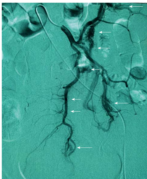
Figure 2 Angiography showing the point of arteriovenous communication (arrows).

hospital for a right groin hernia. Although he had been discharged in good condition, he was readmitted after ten days with symptoms of intestinal obstruction. An abdominal CT scan revealed a dilated colon and extensive transmural edema of the colonic wall extending from the splenic flexure to the end of the rectum along with pericolic fat edema. Dilation of the vascular branches of the IMA-V plexus within the bowel wall of the anal canal, rectum and inferior sigmoid was noted, raising suspicion of an arteriovenous communication (fistula) between the branches of the inferior mesenteric artery (IMA) and vein (IMV) (Figure 1). An elective angiography of the IMA confirmed this suspicion and further defined at least four definite points of high flow between all IMA and IMV branches and with the hemorrhoidal plexus (Figure 2). The patient's worsening condition prompted laparoscopic (robotically assisted) exploration. The pro-