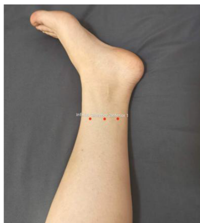
DOI: 10.12998/wjcc.v10.i12.3764 Copyright ©The Author(s) 2022.

Figure 2 Schematic diagram of the needling position for wrist-ankle acupuncture. Superior 1: In front of the ulnar margin on the little finger side, the most depressed part when pressed with the thumb; Superior 2: In the center of the front of the wrist, between the palmaris longus tendon and the flexor carpi radialis muscle tendon, i.e. the Neiguan point; Superior 3: On the lateral side of the radial artery; Superior 4: On the radius margin of thumb when keeping the palm of the hand inward; Superior 5: On the center of the back of wrist, i.e. Waiguan point; Superior 6: On the dorsum of ulnar margin on the side of little finger; Inferior 1: In the inner edge of the Achilles tendon; Inferior 2: In the medial side adjacent to the posterior border of tibia; Inferior 3: At the site one transverse finger inward from the front of tibia; Inferior 4: At the midpoint of the anterior margin of tibia and anterior margin of fibula; Inferior 5: In the lateral side adjacent to the posterior border of tibia; Inferior 6: In the outer edge of the Achilles tendon.