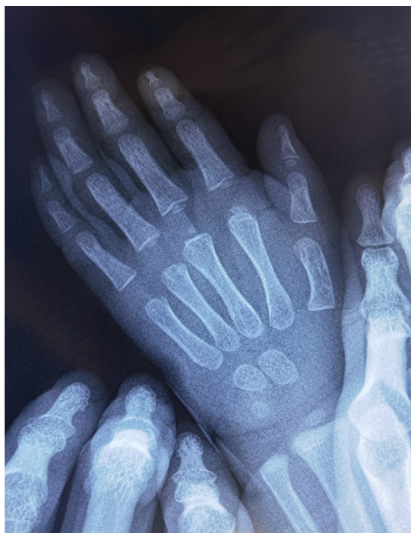
DOI: 10.12998/wjcc.v10.i9.2811 Copyright ©The Author(s) 2022.