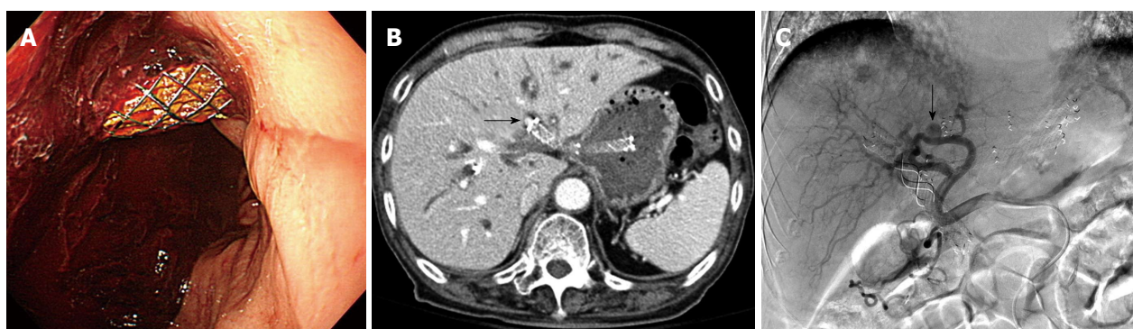
Figure 4 Development of pseudoaneurysm as a late adverse event after endoscopic ultrasonography-guided hepaticogastrostomy. A: There was huge fresh blood clot attached to stent in endoscopic finding; B and C: Since pseudoaneurysm from left hepatic artery was noted in CT and angiography, hemostasis was achieved by embolization of the feeding vessel from the left hepatic artery (arrow).