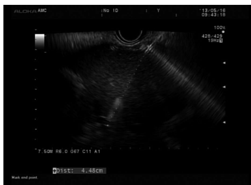
Figure 3 Determination of stent length. The length of an endoscopic ultrasonography needle between gastric wall and punctured left hepatic duct was 4.48 cm ( 4.48 \text{ cm} \times 2 + 1 \text{ cm} = 9.96 \text{ cm} ). Based on our formula, a 10 cm fully covered metal stent was placed for this patient.

the high body of the stomach or the cardia during insertion of the stent in EUS-HGS, we deployed the front one-half of the dual-flap metal stent (8 mm in diameter, 5–10 cm in length, dual-flap fully covered metal stent, M.I. Tech, Gyeonggi-do, South Korea) with a 8.5 F introducer under echoendoscopic and fluoroscopic guidance. After deploying the remainder of the stent within the channel of echoendoscope under fluoroscopic guidance, the echoendoscope was pulled out gently, and the stent was left in the hepaticogastrostomy site. The length of a stent was determined by our formula [the length (cm) of an EUS needle between gastric wall and punctured left hepatic duct on the EUS (representative as approximately half of a stent in hepatic parenchyma) multiply two (representative as remaining half of a stent in deploying inside the echoendoscope, including possible stent shortening) plus 1 cm] (Figure 3). This 1 cm was considered as the intrahepatic bile duct portion of a metal stent. To reduce the resistance of stent deployment inside the channel of echoendoscope, an 8 mm in diameter FCSEMS was applied. Clinical data, including the technical success, adverse events, and other variables, were prospectively recorded and evaluated.