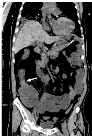
DOI: 10.12998/wjcc.v10.i31.11529 Copyright ©The Author(s) 2022.

Figure 1 The patient's abdominal computed tomography coronary image before the procedure. It shows malignant obstruction (arrow) in the ileocecal region with diffuse small bowel dilation.