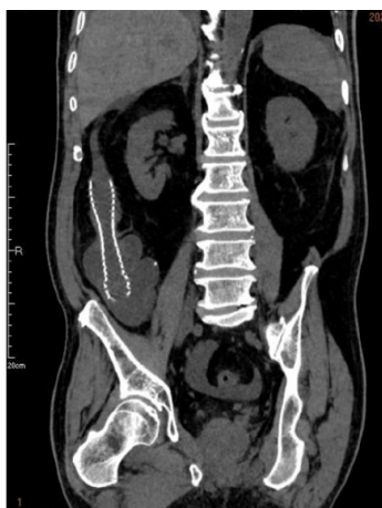
DOI: 10.12998/wjcc.v10.i31.11529 Copyright ©The Author(s) 2022.