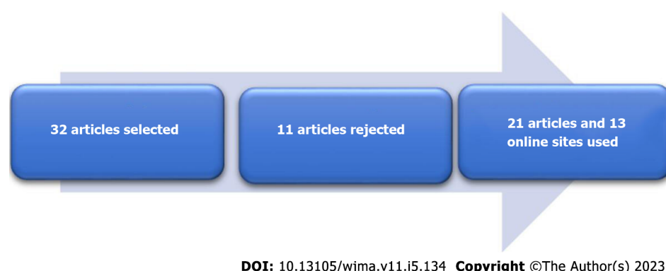
Figure 1 Article selection.

insulin-producing cells[1]. The level of beta cell breakdown in T1DM varies among patients, being fast in some and exceedingly sluggish in others[1]. Keto-acidosis is the most common initial symptom of the illness in most people[1]. Others exhibit symptoms such as fasting hyperglycemia as well as keto-acidosis in the context of environmental variables[1]. Although some people may preserve adequate beta-cell activity to prevent keto-acidosis, many individuals eventually become insulin dependent and develop keto-acidosis[1]. As the condition advances, insulin production decreases, and C-peptide levels become low, and often may become undetectable[1]. A variety of reasons, including heredity, environmental factors, and idiopathic causes have been linked to the autoimmune degradation of beta cells[1]. Some cases of T1DM have an unclear origin as seen in some people of African or Asian descent[1].