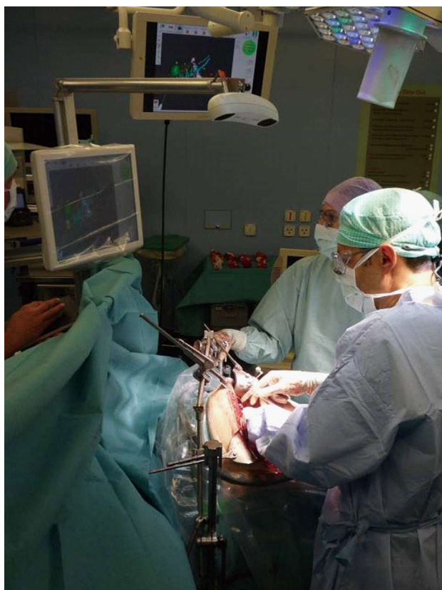
Figure 2 CAScination navigation system as it is placed at the head end of the patient with the sterile-covered touch screen facing towards the surgical team. This allows for easy access and constant interaction with the 3D planning model displayed on the screen.

lesions greater than 3 cm [12] , remain problematic.