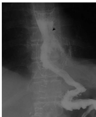
Figure 2 Postoperative fluoroscopy. Anastomosis of the esophagojejunostomy was 6.4 cm above the diaphragm (black arrowhead) with no anastomotic leakage or stenosis.

Total GR: Total gastrectomy; Proximal GR: Proximal gastrectomy; RY: Roux-en Y reconstruction; JI: Jejunal interposition; R0: No residual tumor; E-length: Length of resected esophagus; P-length: Pathological length of esophageal involvement.