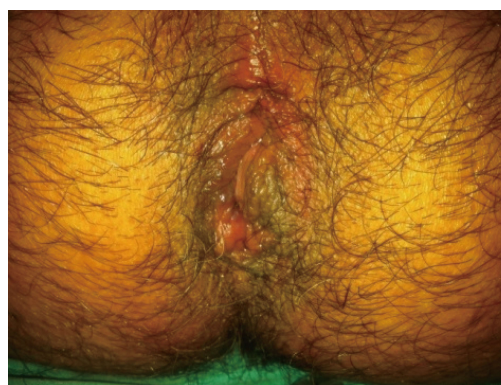
Figure 4 Image after the operation.

Although minimal invasive VZLT that we used in our study is an operative method, vascular ligation, fixation and mucopexy are ensured by a single suture without making tissue excision. VZLT is similar to DGHAL technique with the suture which is put on the root of haemorrhoid, and it is similar to rubber band ligation in collecting the piles. However, severe septic complications can emerge dependent on the necrosis tissue which generates in the distal of the band in the rubber band ligation technique. The success rate of rubber band ligation at 1-2 degree HD is 65%-75% and new bandings can be required in the later periods [11] . No severe septic complication was observed in our study. Vacuum effect can sometimes draw anoderm into the band during rubber band ligation application and severe pains can emerge as a result. In our technique, it is less likely to take anoderm inside because mobile suture is passed through by seeing the mucosa. In our technique, while applying fixed suture on the root of the haemorrhoid, no expensive tool is required as in the DGHAL technique. Giordano et al [12] reported an average operation time of