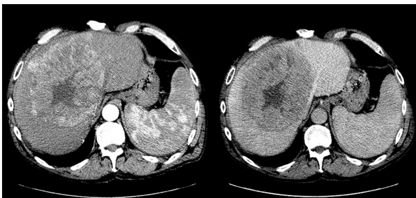
Figure 2 Arterial and portal-venous phase images.

the range of 2.2 to 21.3 mm [59] . Therefore, the value of more accurate localization must be balanced against the additional margin, time, and cost.