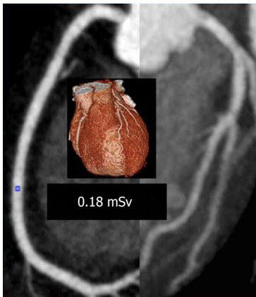
Figure 2 Coronary computed tomography angiography examination with image quality score 4 performed in a 52 years old female patient with heart rate of 56 bpm with a dose of 0.18 mSv.

adaptively apply noise correction at a reduced X-ray exposure without compromising spatial resolution [14] . AIDR and more recently 3D AIDR (AIDR3D) decreases image noise thus allowing for reductions in tube current while preserving overall image quality [15] . BMI-adapted tube voltage and current work synergistically with AIDR3D to reduce image noise while achieving a 75% radiation dose reduction relative to a scan reconstructed with filtered back-projection [16] .