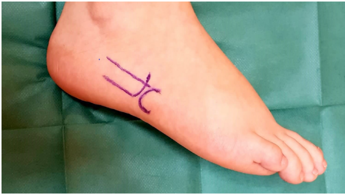
Figure 5 The lateral longitudinal surgical incision for the internal fixation of cuboid fractures.