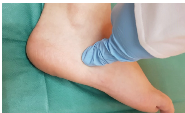
Figure 3 Local tenderness to direct palpation of the cuboid bone following foot injury may suggest cuboid fracture.

complex high-energy injuries involving complex fractures with significant displacement and intra-articular involvement require anatomic reduction and external or internal osteosynthesis depending on the particular fracture characteristics.