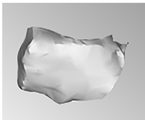
Figure 1 Cuboid bone lateral view.

recent increase in athletic or other daily activity level of an individual. If there is significant periosteal reaction or sclerosis in the fracture area, then a palpable mass may be present in the area of maximum tenderness. The placement of a vibrating tuning fork just above the area of maximum tenderness can cause an increase in pain intensity and has been proposed as a diagnostic method for stress fractures [29] .