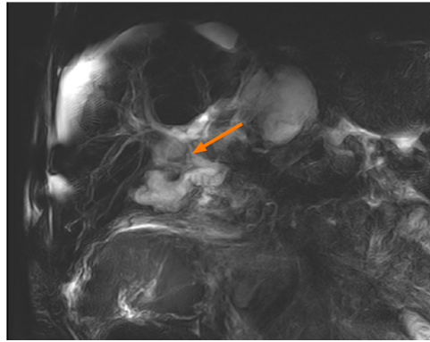
Figure 1 Magnetic resonance cholangiopancreatography showing intrahepatic bile ducts with biliary leakage from the biliary anastomosis.

compared to other solid organs, hyperacute rejection may be observed after LT, especially after ABO-nonidentical/incompatible LT [16] . The issue with antibodies against blood group antigens is a severe risk factor because these antigens are found on the surface of blood cells and also on the vessel endothelium and the cells covering the large bile duct [17] . Moreover, epithelium of biliary tract and endothelium continue to express blood group antigens of the donor up to 5 mo after transplantation leading to increased risk of certain immunological complications related to the bile duct injury and susceptibility to hepatic artery thrombosis [18] .