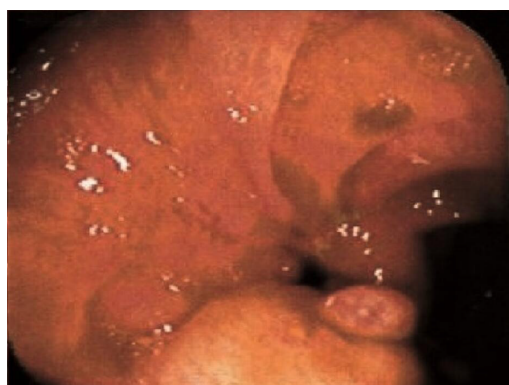
Figure 1 Patient 37's ileocecal valve stricture. Initially narrowed and stenosed lumen was shown.

CR: Complete resolution; PR: Partial resolution; NR: No resolution; Y: Yes; N: No; IMD: Immunomodulator; 5-ASA: 5-Aminosalicylate.