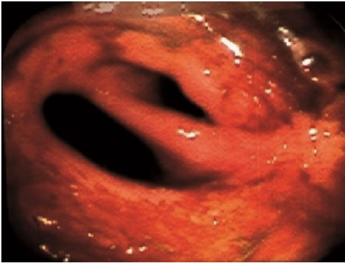
Figure 3 Patient 39's ileocecal valve stricture. Initially inflamed and stenosed lumen was shown.