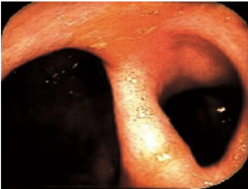
Figure 4 After 12 mo of anti-mycobacterial antibiotic therapy. Healed mucosa and patent opening were seen.