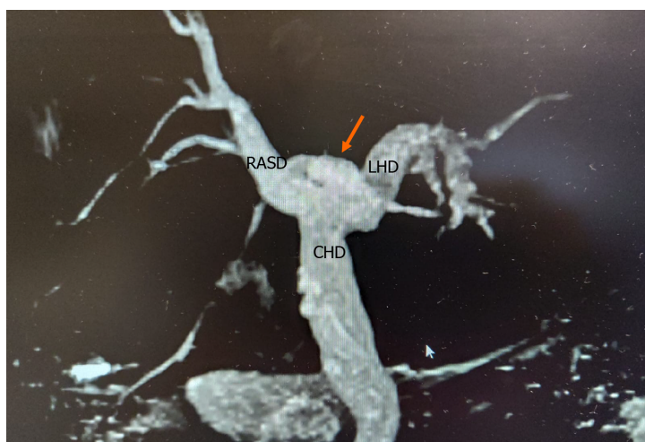
Figure 3 Type 3 variant. The right posterior sectoral duct (arrow) drains directly into left hepatic duct. RASD: Right anterior sectional duct; LHD: Left hepatic duct; CHD: Common hepatic duct.