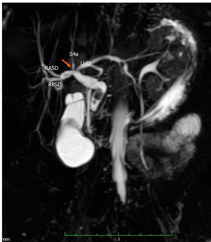
Figure 5 Undefined variant. The image shows a quadrifurcation (arrow) that is formed by the union of the right anterior sectoral duct, right posterior sectoral duct, segment IVa duct (S4a) and the left hepatic duct (LHD). RASD: Right anterior sectional duct; RPSD: Right posterior sectional duct; LHD: Left hepatic duct; S4a: Segment Iva.

variants to studies from these geographic locations. There were no published studies reporting biliary variants in West African populations but there were four studies reporting 494 variants in 876 individuals from North Indian populations[30,39,41,43]. In our population there was a significantly lower incidence of all bile duct variants than that seen in Indian populations (28.3% vs 56.4%, P < 0.001 ), probably due to decades of population mixing in our setting.