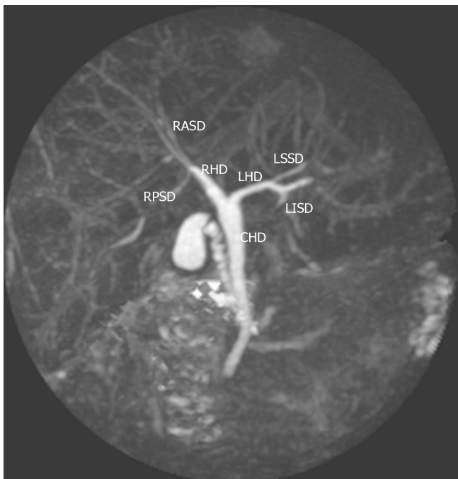
Figure 1 Type 1 (classic) variant. In this system, the right hepatic duct (RHD) is formed by two tributaries: the right posterior sectional duct that drains segments VI and VII coursing in a horizontal plane and the right anterior sectional duct draining segments V and VIII and coursing in a vertical plane. The left hepatic duct (LHD) is formed by two tributaries: the left superior sectional duct that drains segment IVa joins the left inferior sectional duct that drains segment II, III and IVb. The RHD and LHD then join to form the common hepatic duct (CHD). RASD: Right anterior sectional duct; RPSD: Right posterior sectional duct; RHD: Right hepatic duct; LHD: Left hepatic duct; CHD: Common hepatic duct; LSSD: Left superior sectional duct; LISD: Left inferior sectional duct.

RASD: Right anterior sectional duct; RPSD: Right posterior sectional duct; RHD: Right hepatic duct; LHD: Left hepatic duct; CHD: Common hepatic duct; LSSD: Left superior sectional duct; LISD: Left inferior sectional duct.