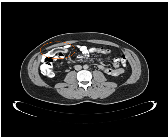
Figure 2 Abdominal computed tomography scan revealed a central area of fat attenuation surrounded by a thick collar of soft tissue attenuation suggestive of Meckel's diverticulum.