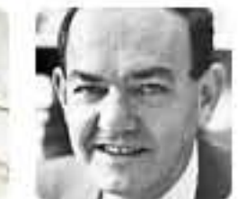
Herbert A. Simon