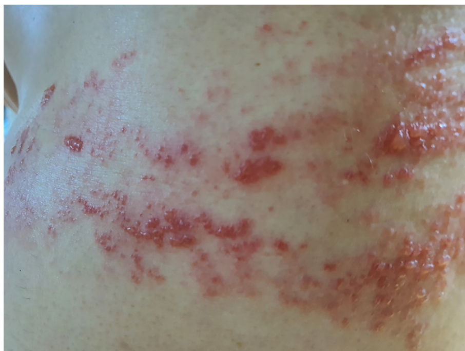
Figure 1 Multiple vesicles on the axillary side of the left chest.

patient classified the stinging pain intensity of the vesicle eruption as 7.