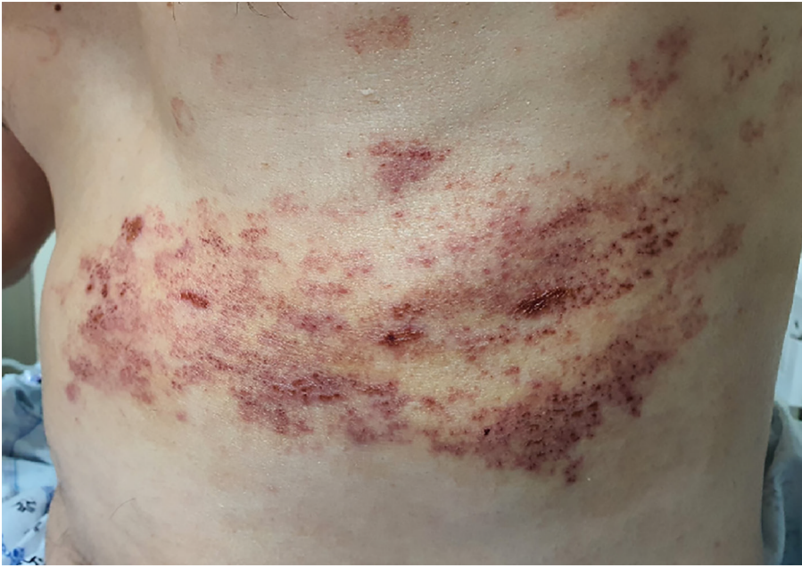
Figure 2 After 1 wk of hospitalization with antiviral and corticosteroid treatment, the vesicular eruption showed improvement.