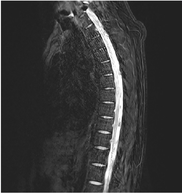
Figure 3 Spine magnetic resonance imaging made on admission. High signal intensity was apparent within the left spinal cord at level T2-8 on a T2-weighted image.