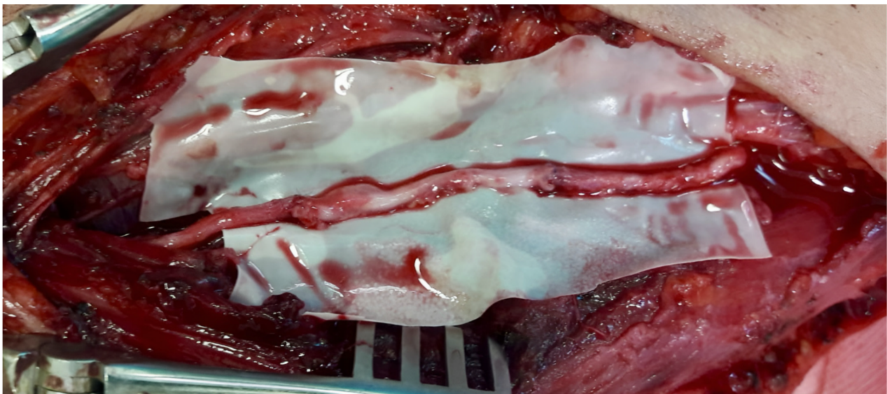
Figure 2 An intraoperative photograph. A gap of approximately 7 cm was observed in the injured radial nerve trace. Sural nerve graft was taken and repair of this gap was achieved with microsurgical technique. In the photograph, the light coloured part in the middle along the nerve line shows the sural nerve graft.

The degeneration of the axon and myelin in the distal stump occurs within a very short timeframe, typically within a few hours. Subsequently, macrophages gather at the site of injury, playing a crucial role in the clearance of cellular debris. During the initial 24-h period, SCs undergo proliferation and transition from a myelinating state to a regenerative one. This transformation is accompanied by an increase in the expression of several molecules that play a role in both the degenerative and regenerative processes occurring simultaneously[33]. Following the clearance of debris by SCs and macrophages, SCs initiate the formation of Büngner bands, which create a trophic-rich environment that facilitates directed axonal regeneration. Similarly, the target organ that has been denervated experiences a depletion of trophic factors, resulting in the atrophy of muscle fibers and the death of satellite cells.