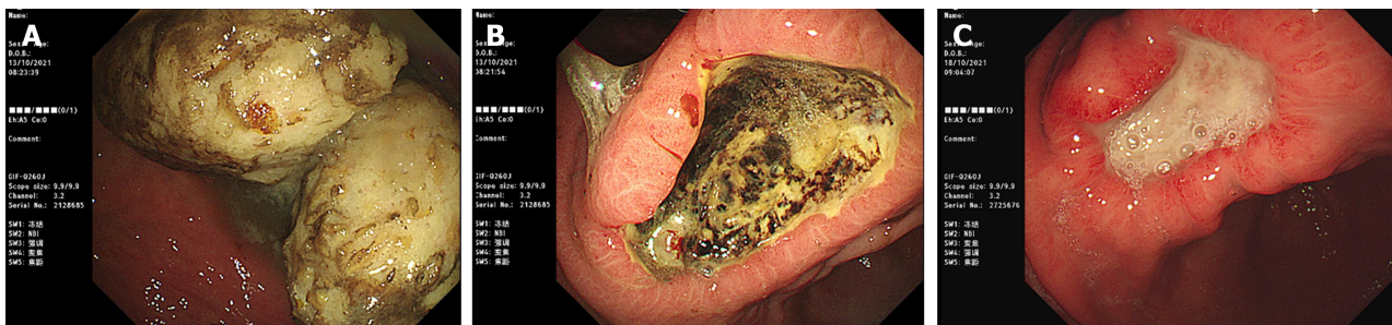
Figure 2 Image of gastric phytobezoars in a patient with a gastric phytobezoars history of 7 d. A: Gastric phytobezoars (GPBs) located in the stomach; B: The gastric ulcer, which is shallow and bleeding located in the angulus of the stomach; C: No GPBs or bleeding in the stomach was observed after Coca-Cola therapy.

DOI: 10.4253/wjge.v16.i2.83 Copyright ©The Author(s) 2024.