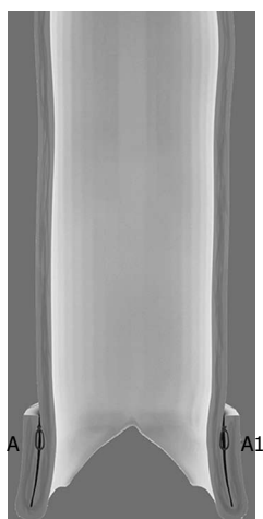
Figure 2 Oesophageal flap valvuloplasty. The seromuscular layer of the interrupted absorbable monofilament suture was used to suture the 1 cm-long fold around the remnant oesophageal flaps in the AA1 site forming modified oesophageal flaps.

sulphate) was performed to evaluate oesophageal motility patterns, and endoscopy was conducted to evaluate the level of mucosal damage [14] . pH monitoring was performed to demonstrate gastrooesophageal reflux [15] . The diameters of oesophageal lumen 1.5 cm below and above the anastomosis were evaluated by radiographic studies under standardised conditions for anastomotic circumference assessment. In addition, anastomotic leakage in dogs can also be easily observed by X-ray imaging.