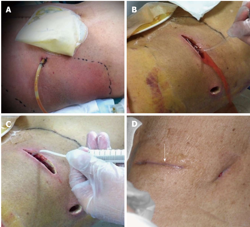
Figure 3 Inflamed area of the abdominal wall and parastomal fistula (supine position) (A); rinsing the wound with saline solution (right lateral position) (B); and infusing the wound with moist exposed burn ointment (syringe) (C); and the wound finally healed well (arrow) (D).

lated tissue grows better and the wound is clean without purulent secretion. Moist exposed burn therapy and moist exposed burn ointment are better than traditional dressings [6] , because keeping the wound moist can prevent shrinkage of the incision. The main components of moist exposed burn ointment are zinc acetate and silver acetate. Silver and zinc ions have strong bacteriostatic functions toward E. faecalis , P. aeruginosa , Staphylococcus aureus and Klebsiella . Moreover, as an activating agent of biological enzymes, zinc ions can accelerate the synthesis of protein and nucleic acid to promote wound healing [7] .