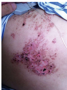
Figure 1 Presentation of characteristic rash. Image showing the rash, which had begun to scab, on the patient's right thoracodorsal area.