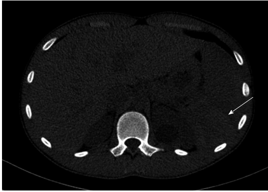
Figure 1 Computed tomography (white arrow) shows a hematoma at the upper pole of spleen.

a case of emergency LPS for a patient who suffered from splenic rupture.