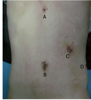
Figure 2 Size and distribution of trocars. A: Subxiphoid, 5-mm; B: Upper umbilicus, 10-mm; C: Left mid clavicular line, 12-mm; D: Left axillary line, 5-mm.

from the 12-mm incision. A closed drainage was placed in the splenic fossa. The operative time was 150 min and the estimated blood loss was 200 mL. The post-operative course was uneventful.