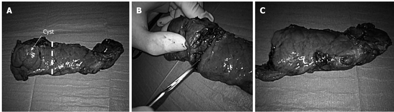
Figure 2 Specimen after distal pancreatic resection. A: An arrow marks the cystic lesion; the interrupted line marks the site of transection; B: Transection of the pancreas distal from the lesion; C: Spared pancreatic parenchyma.